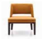
4 OWENS "ARMCHAIR" ARMCHAIR CM 72X72 H76