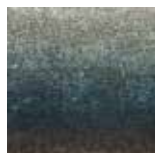
9 DIBBETS RAINBOW "FOREST" RUG CM 400X300