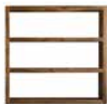
8 JOHNS BOOKCASE CM 180X40 H174