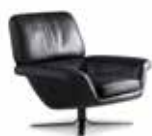
3-4 BLAKE-SOFT ARMCHAIR CM 94X98 H89 OTTOMAN CM 65X65 H38