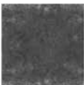
8 MATT DIBBETS RUG CM 300X300