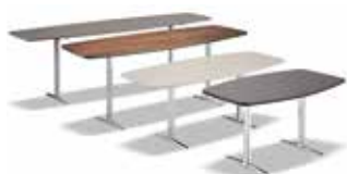
7 WILSON CONSOLE-TABLE CM 180X50 H55