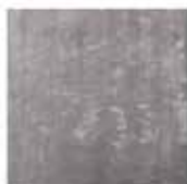
9 DIBBETS RUG CM 300X200