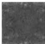
9 MATT DIBBETS RUG CM 500X500