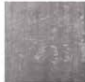
8 DIBBETS RUG CM 400X300