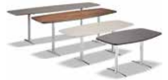
6 WILSON CONSOLE-TABLE CM 120X50 H55